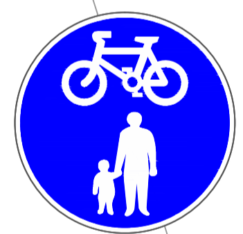
Diag. 956 sign mounted on back of existing sign post.