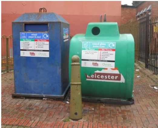
Example of current recycling banks

Demand for the service has therefore fallen overall, and it has become less efficient. Furthermore, the recycling banks are old, so the proposed changes provide an opportunity to modernise the network, providing new, more attractive bins that accept a wider range of materials for recycling.