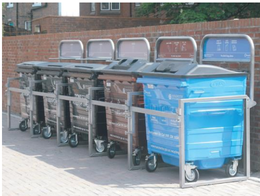
Example of how the new bins could look

Please note - The bins would be placed in a locking frame to prevent movement, and they would be installed with special lids to prevent their misuse.