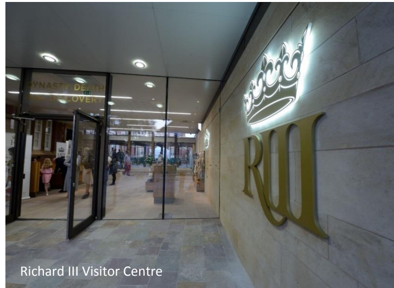
Richard III Visitor Centre

Festival and events in Leicester now provide a year long cultural programme. Over the past 3 years annual visitors to Leicester festivals have increased from 460,000 to over 680,000 contributing more than £23m to the city economy