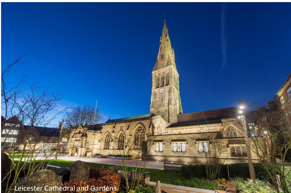
Leicester Cathedral and Gardens

Regeneration of the Waterside area is gathering pace with plans now in place for a 60 hectare regeneration project and funds secured from the LLEP to assemble land and deliver highway and other essential infrastructure. The dramatic conversion of Friars Mill from a burnt out shell to new office workspace is complete and work is already underway on a second phase reflecting the strength of demand. A major student residential scheme is nearing completion and there are plans to develop Jewry Wall Museum.