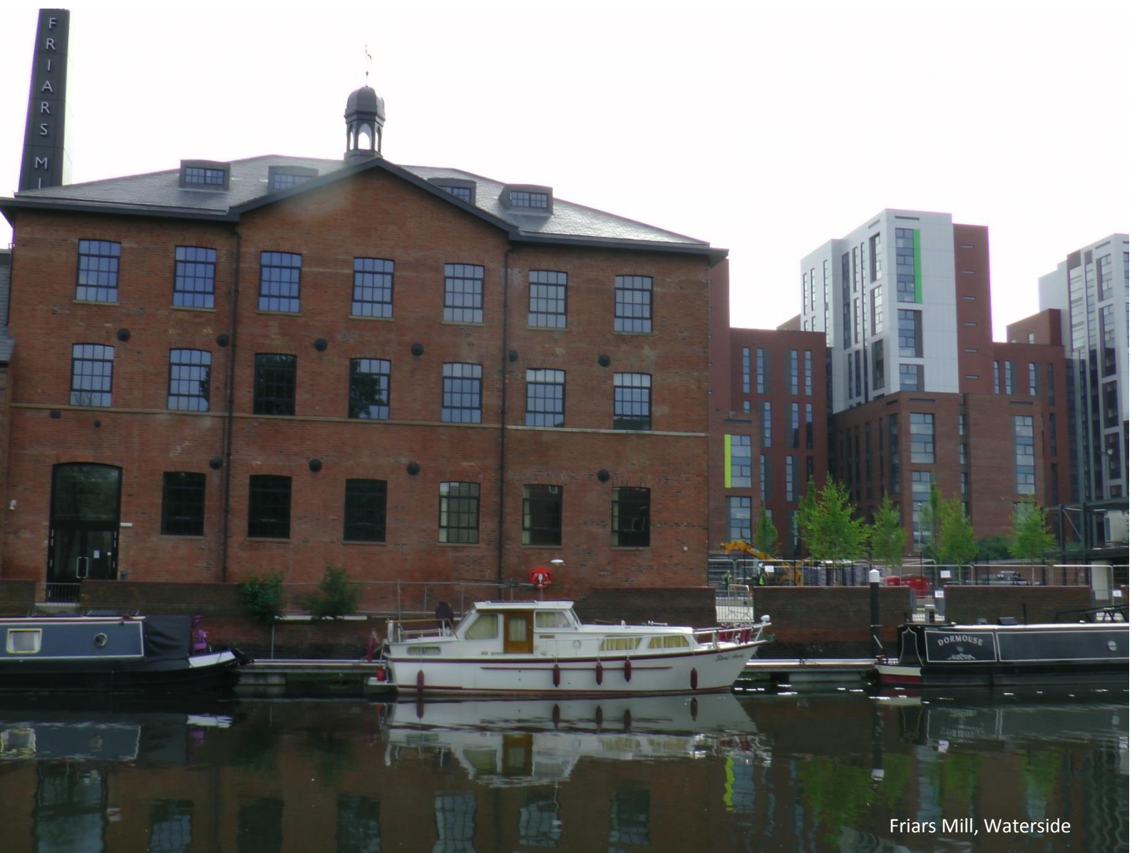
Friars Mill, Waterside