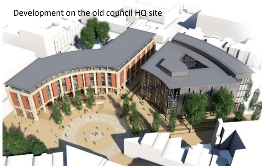
Development on the old council HQ site