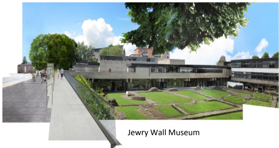
Jewry Wall Museum

success of our high profile national sports clubs to contribute to strengthening the local economy, particularly through additional visitors to the city.