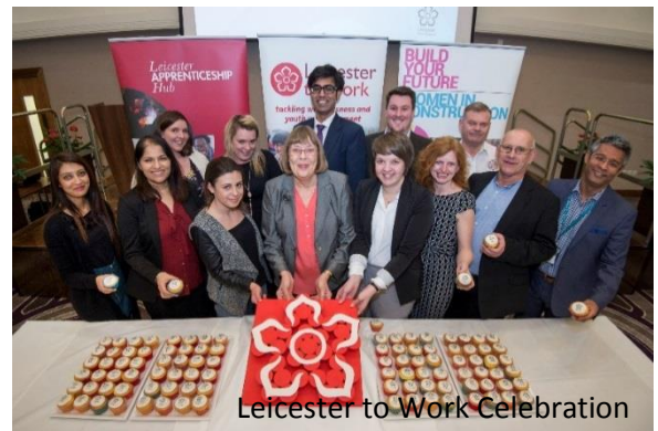
Leicester to Work Celebration

Leicester City Council has been active with its own recruitment to encourage more young people into the city council. These have been through 6 month work placements, graduate and apprenticeship opportunities. Recently we held our second celebration event for more than 100 people who have joined the council through one or other of our employment initiatives.