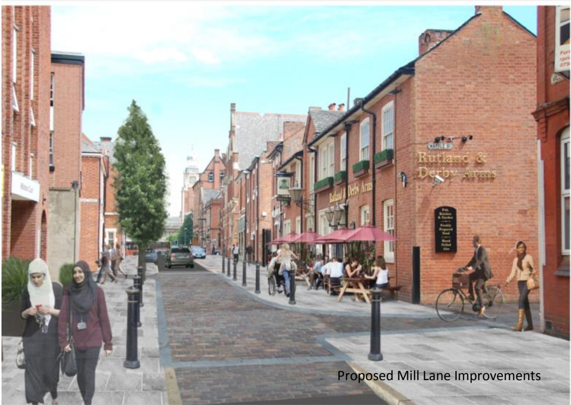
Proposed Mill Lane Improvements

Action CL7: In addition to the above, other actions to meet targets by 2020 are set out in our Air Quality Action Plan and Sustainability Action Plan to meet our carbon reduction targets.