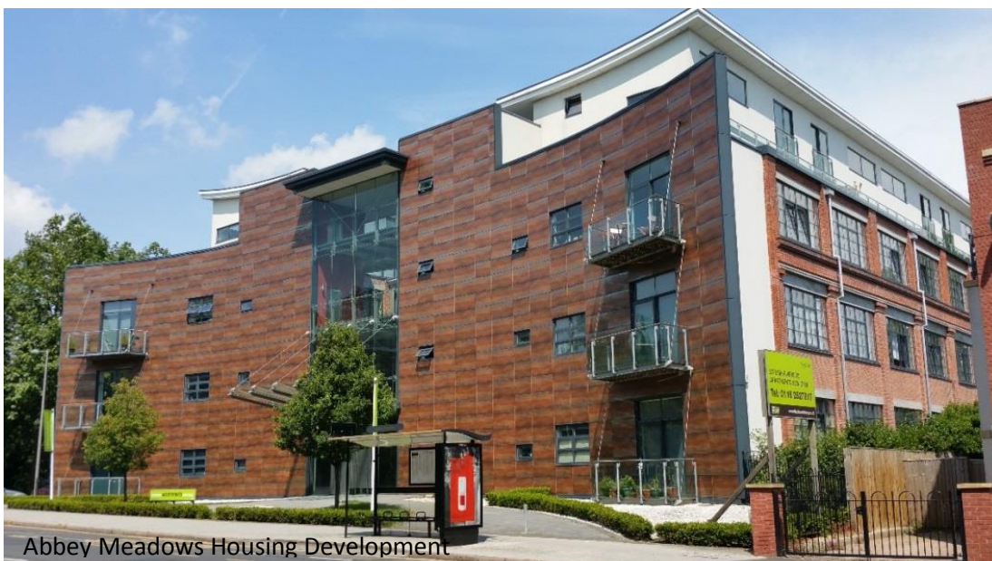
Abbey Meadows Housing Development

The long standing ambition to create a major new sustainable development on the outskirts of the city at Ashton Green is starting to be realised. Initial investment from Samworth Brothers saw the opening of a new food processing factory creating up to 700 jobs. More employment development is being planned and the first phase of what will ultimately be 3000 new homes will start in 2016.