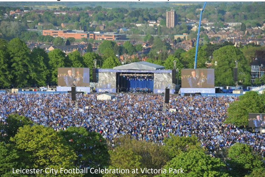
Leicester City Football Celebration at Victoria Park

More than 40,000 people have now visited the 'Fearless Foxes' exhibition at New Walk Museum. Put together in only 45 days it tells the story of Leicester City's magical 2015/16 Championship season.