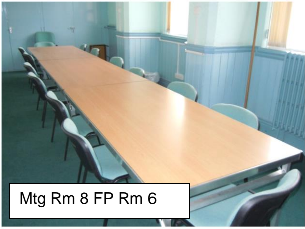
Mtg Rm 8 FP Rm 6