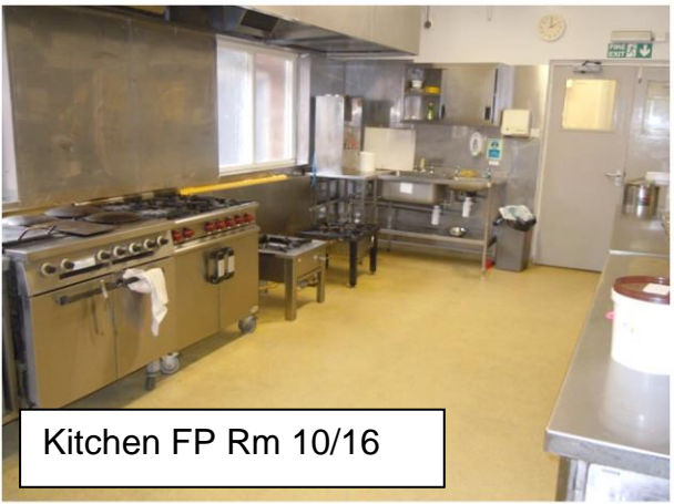
Kitchen FP Rm 10/16