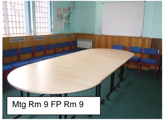
Mtg Rm 9 FP Rm 9