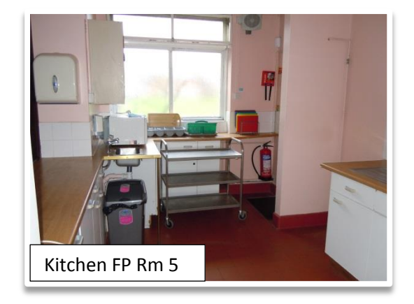
FP = Floor Plan