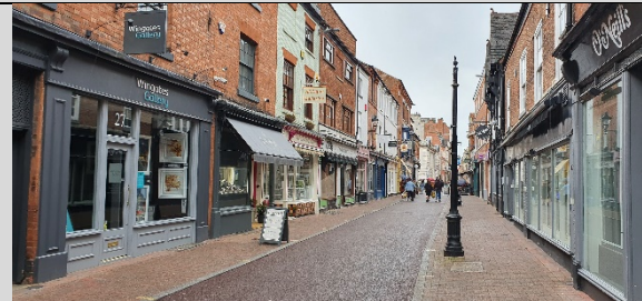
Figure 2: Loseby Lane