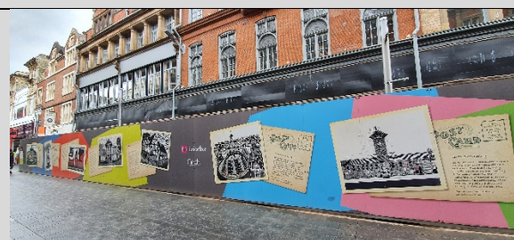
Figure 8: Market Street