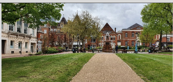
Figure 7: Townhall Square