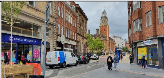
Figure 3: Horsefair Street