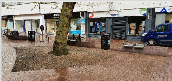
Figure 5: Examples of Street Furniture