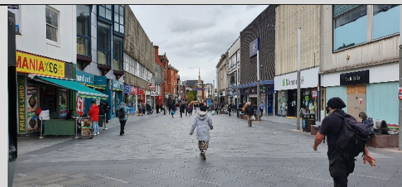
Figure 6: Gallowtree Gate