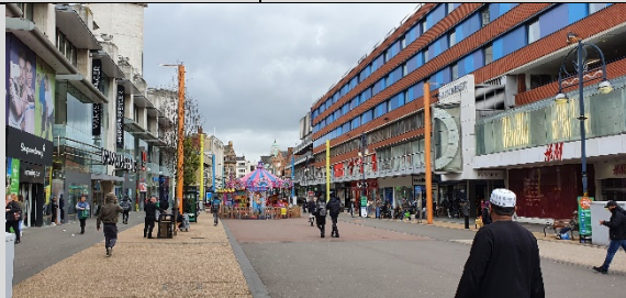
Figure 1: Humberstone Gate

Experian Goad data indicates that Leicester city centre (as defined by Experian Goad) accommodates 292,590 sq.m of gross floorspace across 1,099 units. The Experian Goad data was updated by Nexus Planning through a survey of the centre undertaken in June 2021.