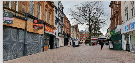
Figure 4: Cheapside